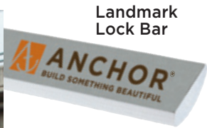
Landmark Lock Bar

*Product dimensions are height by face length by depth. Actual dimensions and weights may vary from these approximate values due to variations in manufacturing processes. Specifications may change without notice. See your Anchor representative for details, color options, block dimensions and additional information.